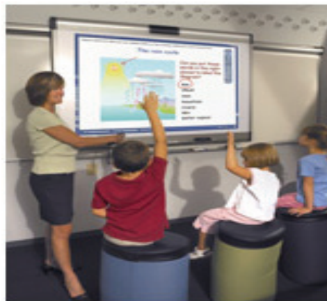
Promethean ProACTIVboard 78"

Introduces the Promethean 'ProACTIVboard' a cutting edge interactive technology that's taking teaching into another dimension!